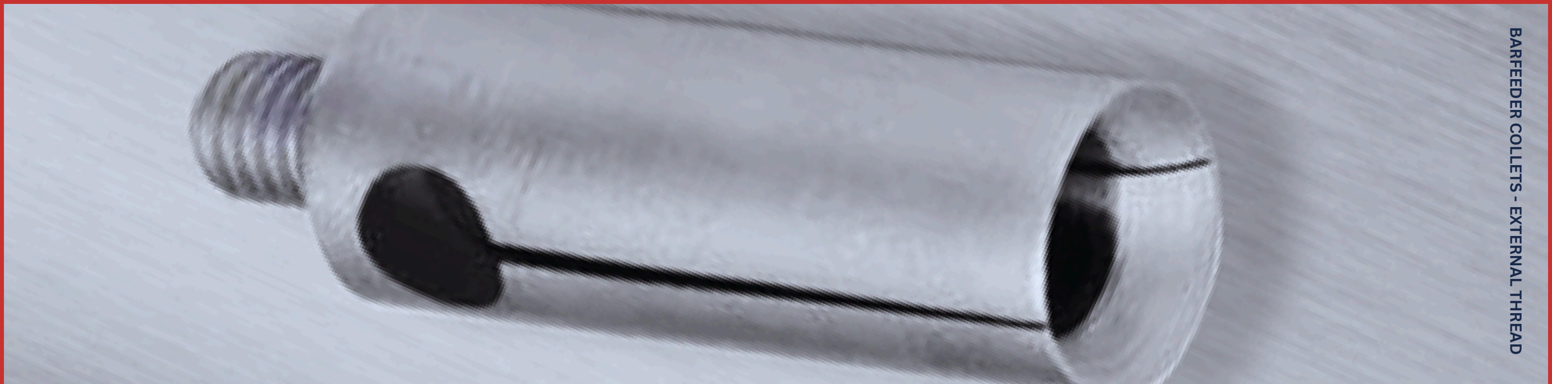
BARFEEDER COLLETS - EXTERNAL THREAD

Holdings Technologies Innovations Feed Fingers are precision-ground to exact sizes, guaranteeing the highest machining standards and providing exceptional performance in even the most demanding applications. Collets are available in both smooth and serrated. Round / Hexagon / Square /Profile options to meet various application needs.